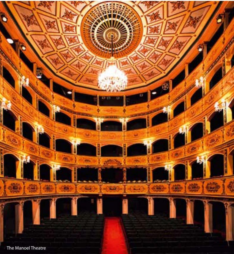
The Manoel Theatre

This event celebrates the essence of Valletta – culture, entertainment and shopping, by means of a variety of events and initiatives around the capital city. www.visitmalta.com/events