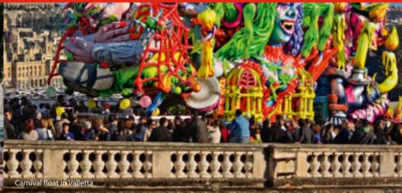
Carnival float in Valletta