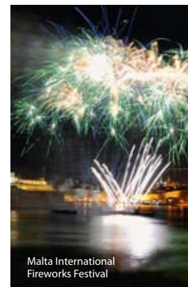
Malta International Fireworks Festival

The 9th Edition of the Malta International Fireworks Festival will be organised once again in and around the majestic Grand Harbour – the perfect setting for this event. The Festival will take place on the 29th and 30th of April 2010. On the 24th of April the 4th Mechanical Ground Fireworks Display will take place on the granaries (il-Fosos) in Floriana. www.visitmalta.com/events