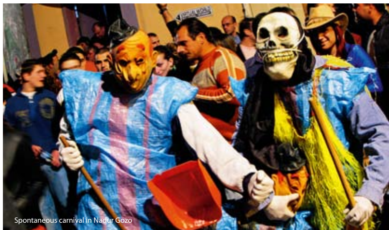
Spontaneous carnival in Nadur Gozo